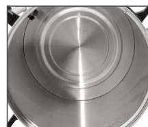
Stainless Steel Interior