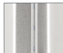
Water Gauge Indicator