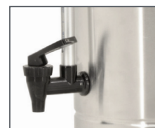
Non-Drip Water Faucet